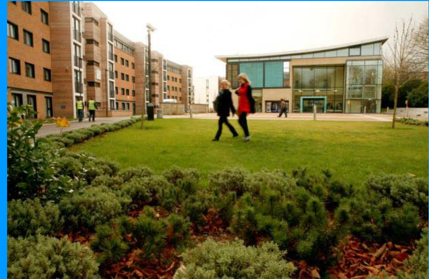
The Endcliffe Village